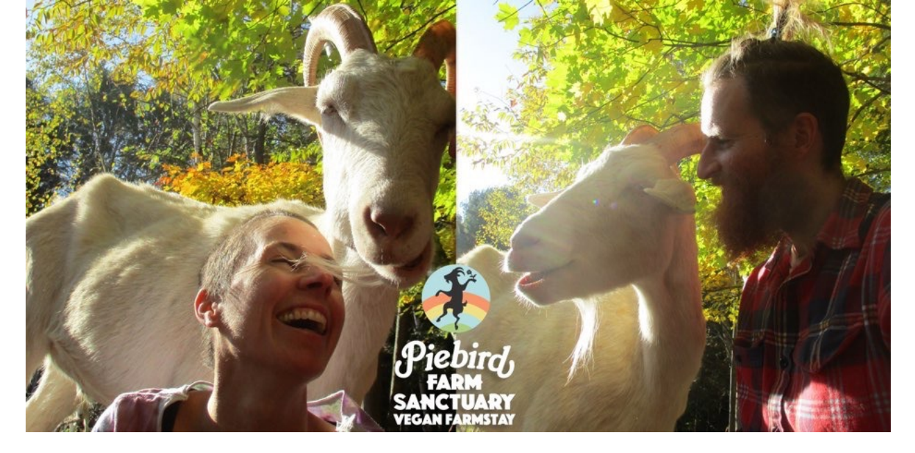
Sunshine lives free as an autonomous individual, with his personhood respected.