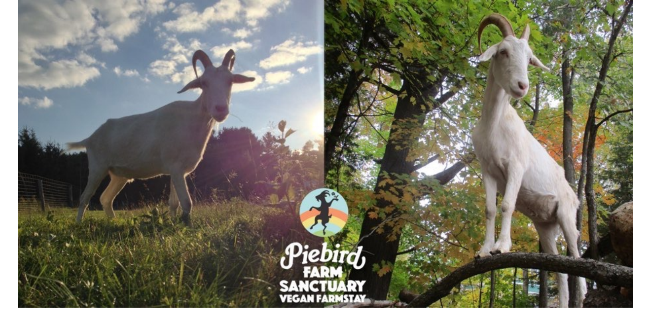
Sunshine, living free in sanctuary at Piebird Farm Sanctuary